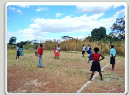
Playing Rounders at Arise Youth Club

The number of college students that Arise can support is determined by the sponsorship that is received. If you are interested in sponsoring a college student please email us at arise@kaniki.dk .