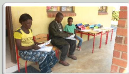
Parent/Guardian meetings at Kapumpe

One of our Zambian teachers has begun a three year course during the holidays that will enable him to convert his teaching diploma into a degree.