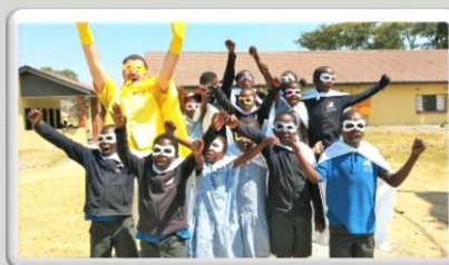
Superhero craft in Grade 2 led by the Hope Church Team