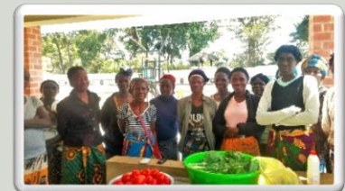
Arise guardians learning how to cook more healthily

www.fromkanikiwithlove.blogspot.co.uk/2016/07/masterchef-zambian-style.html