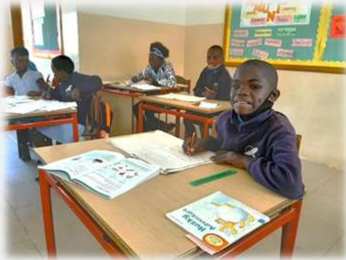
Pupils enjoy using books for reading and writing

They will soar on wings like eagles. Isaiah 40:31