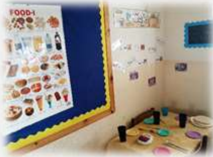
The café role play corner for this topic