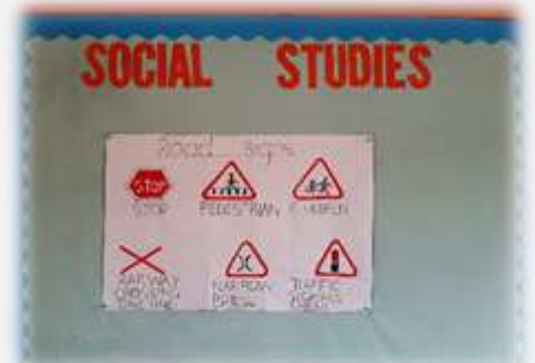
Ready to learn about road safety

'The Newsroom' has been our recent topic in Grade 2 and the pupils have really enjoyed thinking about what is going on in the world. We have been focusing on the local community of Kaniki but also thinking about other places at times. It is very hard for many of these 6-7 year olds to imagine other places as some of them have never been outside this area. Despite not having much first-hand knowledge of different places and sights, their memory is incredible! After teaching them new words, pictures, places, the pupils are avidly wanting to demonstrate what they have learned over the following days and weeks.