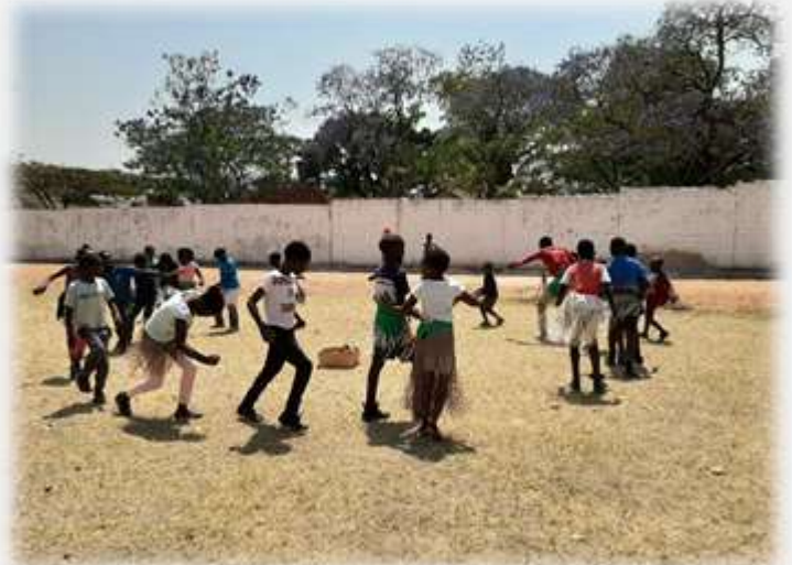
Learning how to perform traditional dance

A common trait shared by the pupils and the staff here is the love of learning. When we cannot have something we love for some time we all feel the pain of separation and the joy of being reunited. During term 2 we have all felt the pain of not having our school learning. Many others around the world will be able to identify with the joy of returning to school with full classes rather than only the teachers in school. Although the teachers have been in school preparing lessons, classrooms and resources, school is just not the same when the pupils are not there. Following the closure of schools in June for nearly 3 months, we have embarked on a busy and focused 17 weeks of school to cover the remaining term 2