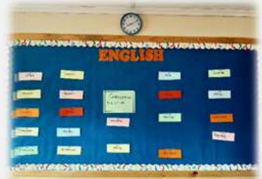
Helping the pupils acquire a wide vocabulary