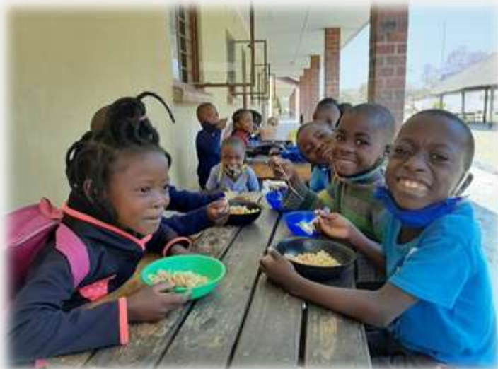
Break time food is a highlight of the school day

Having asked many pupils about what they would like to improve on now they are back at school, most have said their reading. Through the use of books in lessons at all ages, they are becoming aware that being able to read is central to learning and becoming independent. It's wonderful to hear the children so excited to read and develop their skills.