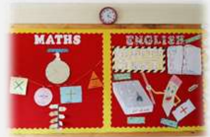
Creative and engaging display boards encouraging pupils to read and apply new ideas

This term some new pupils have been welcomed into Grade 5 and made to feel very much part of the class family. They have enjoyed learning about safety and demonstrated some of their knowledge when our nsaka roof caught fire. A neighbour was burning in their field and the wind carried the fire to Kapumpe. Mr Muleya and the Grade 5's were a big help in dousing the roof with water so that only a small section of the roof was in need of repair. As well as learning the academic subjects Grade 5 have been enjoying retelling Bible stories, taking care of their own vegetable patch and reading a variety of books together.