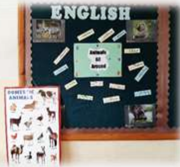
Helping pupils describe animals as well as name them

The pupils in Grade 3 always love the topic 'Animals All Around' as it is one that many of them feel they already know something about. They know the names of some animals, where they live and what they eat and this helps the pupils to feel very confident. As the topic goes on, the pupils learn adjectives and new facts allowing them to talk and write more creatively. Grade 3 have been improving both their reading and writing speed and their behaviour is also showing signs of maturity. We are very pleased to see the progress they are making.