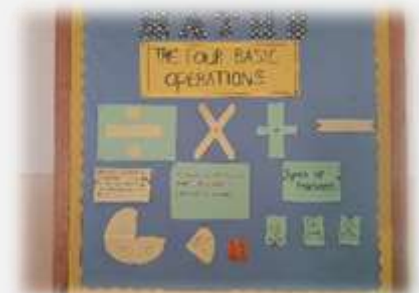
Using visuals to help the children understand in maths