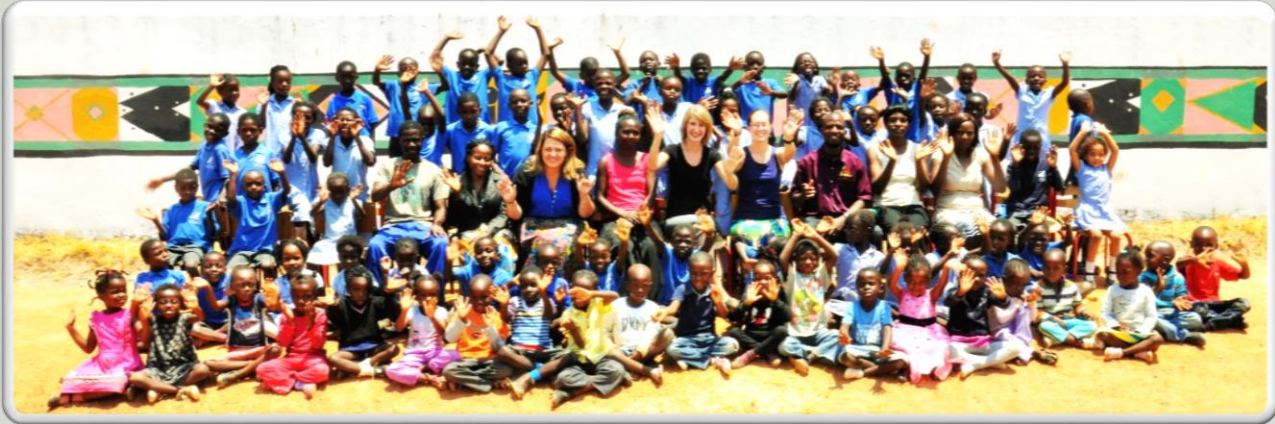
Term 3 at Kapumpe Christian Primary School