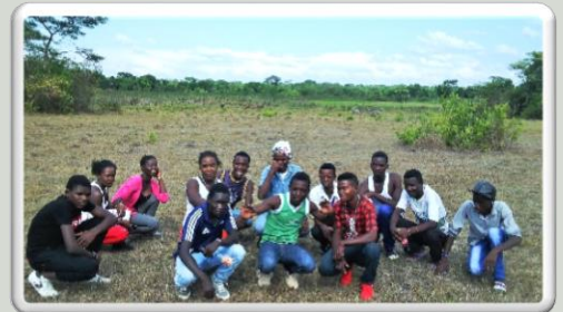
Grade 10 & 11 at Nsobe

Thank you to the charity three:eighteen for sponsoring the trip.