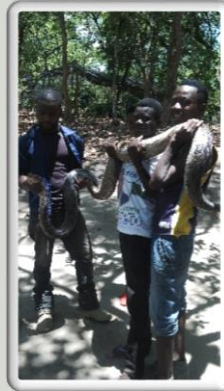
Holding the biggest snake at Nsobe!