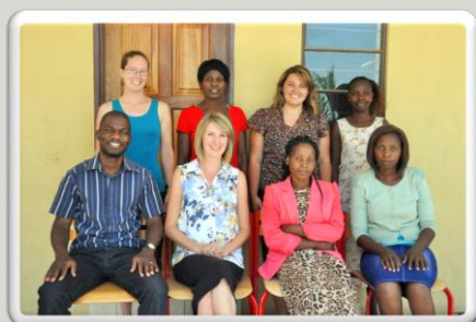
Kapumpe teaching staff 2016

It has been a long journey to get to this point but we can see God's faithfulness and wisdom in his timing. Thank you to everyone who has prayed about this.