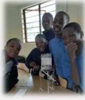
Building water towers