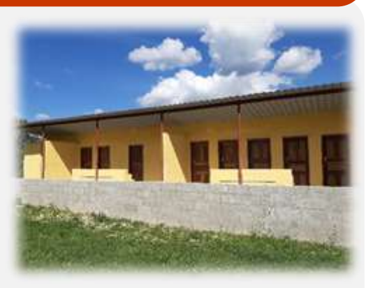
Our block includes boys, girls and staff toilets as well as a male and female shower