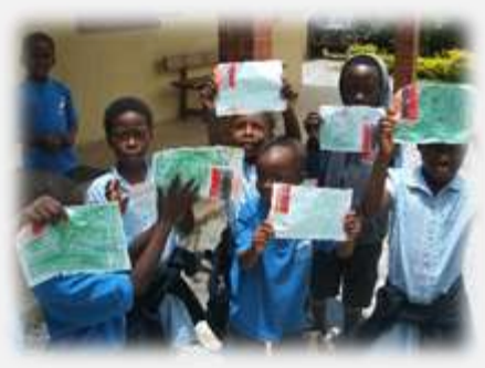
Learning about the national flag