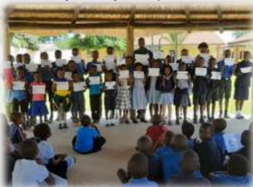
Pupils in Friday assembly receiving their star certificates in recognition for their effort and behaviour at school

We look forward to sharing our celebrations with all of our supporters during the year and would also like to say a BIG thank you for your input.