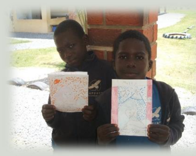
Designing and making their own Christmas cards