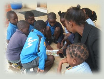
Choosing reading as a favorite activity