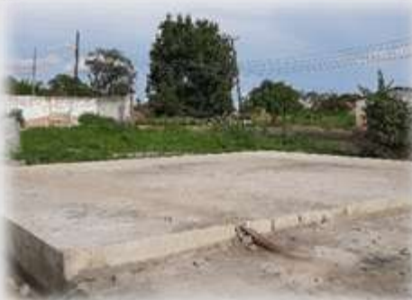
Curing the slab with rain for the Arise Block