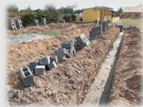
Laying the foundations for the Arise Block

We know that to be able to continue our work we need a building for teaching and resources. We hope to complete the building in 2021 once the funds have been raised.