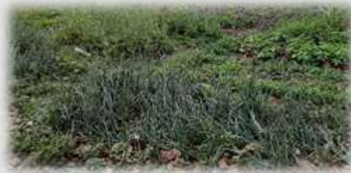
Arise field vegetables

We have also prepared a larger portion of our field for maize than last year as we have the space, dedicated guardians and always a good harvest. We look forward to sharing more farming techniques and messages from God's word as we welcome all our guardians back to join us again in 2021.