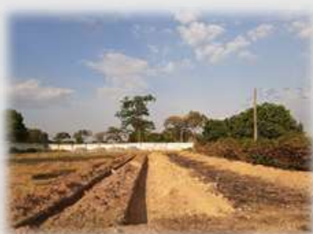
Digging the trenches to mark out the Arise Block