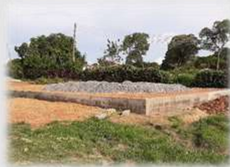
Preparing to lay the final slab of the Arise Block